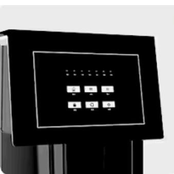
HIGH DEFINITION TOUCH SCREEN