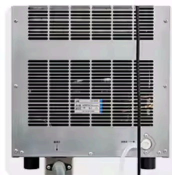
TWO TYPES OF WATER SUPPLY INTERFACES